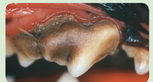
Figure 3: Periodontitis with very inflamed and receding gums