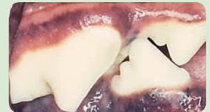
Figure 1: Healthy mouth