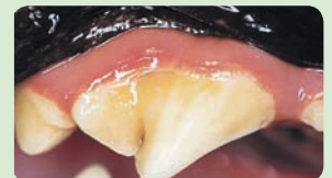
Figure 2: Gingivitis with early calculus